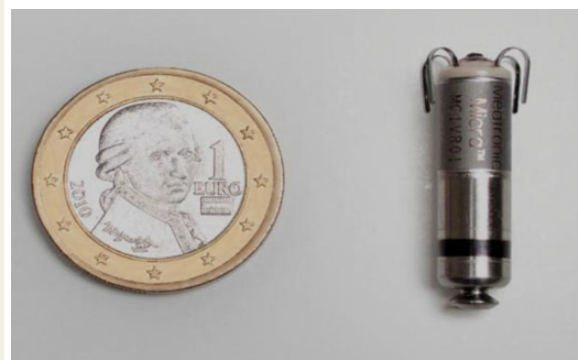
Figure 2 The Medtronic Micra™ Transcatheter Pacing System.

The primary fixation mechanism of the LCP device is a screw-in helix with a maximum penetration depth in tissue of 1.3 mm. Three nylon tines provide a secondary fixation mechanism by avoiding