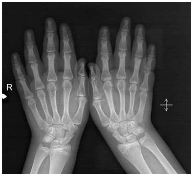
Fig. 2. X-ray showing a drumstick appearance.

Sequence analysis was performed on all 22 of the exons and the exon–intron boundaries of RPS6KA3 by using the ABI 3130 capillary electrophoresis system. Heterozygote variation c.1973_1974insA (p.M659Dfs*55) was found on exon 21, generating a frameshift mutation beginning in p.Met659 and stopping at the stop codon at position 713. As this event constitutes a truncating mutation and frameshift variant, protein units after position 659 become defective. As seen in Fig. 3, this variation causes damage to the functional protein kinase domain, resulting in a novel mutation. Based on our in silico evaluation of the functional effects by using the mutation