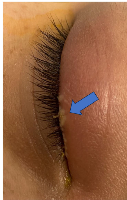
FIGURE 1 Images demonstrating clustered vesicular rash of bilateral eyelids.