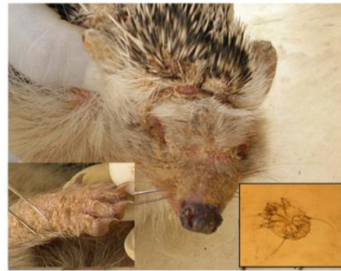
Fig. 2. Hedgehog ( E. algirus ) with mange ( S. scabiei ) on face and leg.

Seventy hedgehogs were sampled in total, 39 (55.7%) of which were found to be infested with ectoparasites (Table 1). Four species were identified, one mite ( Sarcoptes scabiei ) (Fig. 2), one tick ( Rhipicephalus appendiculatus ) (Fig. 3) and two fleas species ( Xenopsylla cheopis and Ctenocephalides canis ). A total of 44 ticks and 491 fleas were collected from infested hedgehogs. The prevalence of S. scabiei , Rh. appendiculatus and the two species of fleas were 10 (25.6%), 8 (20.5%) and 11 (28.2%) respectively. The prevalence of mixed infestation with S. scabiei and C. canis was 3 (7.7%), Rh. appendiculatus and C. canis was 2 (5.1%), and infestation by two species of fleas was 5 (12.8%).