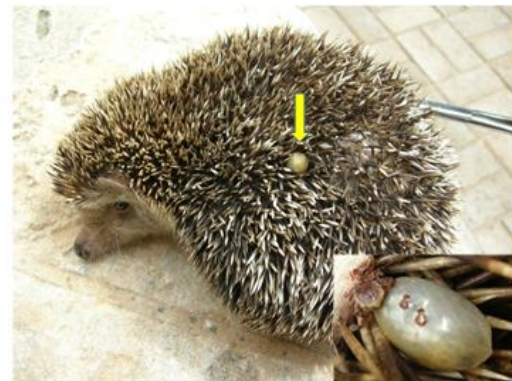
Fig. 3. Hedgehog ( E. algirus ) infested with ticks (Male and female).