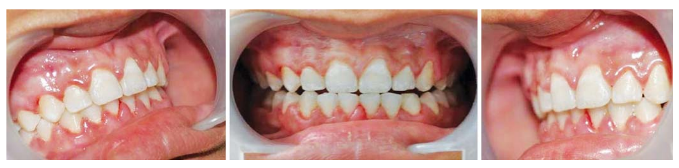
Fig. 2: Intraoral photos at the time of debonding

Effect of Fluoridated Toothpaste on White Spot Lesions in Postorthodontic Patients