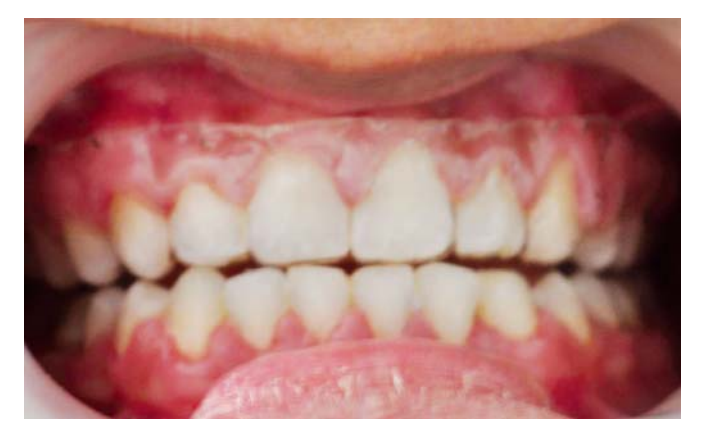
Fig. 1: Individual plastic mouth tray

dentition). The tray was applied to the teeth immediately after toothbrushing with nonfluoridated paste and kept in place while using the fluoridated paste in mandibular dentition and for a minimum of 2 hours afterward. Written instructions, with photo illustrations, were also given to the patient to ensure that the brushing technique and the mouth tray were used correctly. All subjects were told to use fluoridated toothpaste (Sodium Fluoride EP 0.32% w/w 1450 ppm F, Colgate Total 12, India) thrice a day on the test arch, but they were instructed to use no other fluoride products during the 8-week trial.