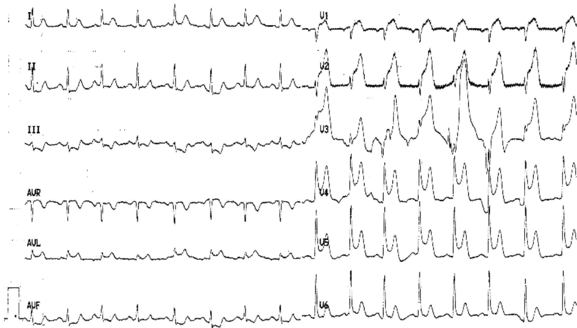
Figure 1. ECG shows ST segment elevation in leads aVL and V1 to V5.

air, 96%. The patient did not have any family history of coronary artery disease or any other risk factors such as smoking or alcohol abuse. The physical examination was completely normal with no S3 or S4 sounds documented. Electrocardiography (ECG) before securing venous route showed ST segment elevations in leads V1 to V5 and aVL ( Figure 1 ).