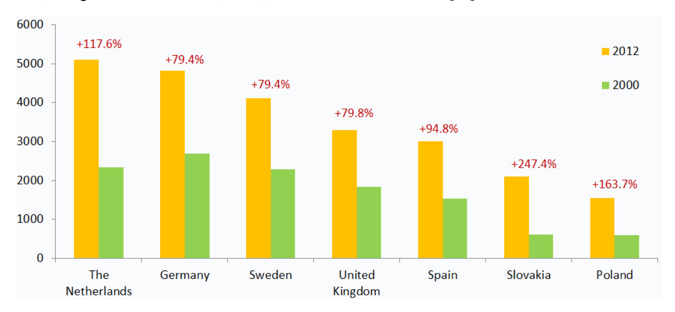
Figure 2. Growth in health expenditure per capita in select European markets, 2000–2012 (USD PPP). This figure shows an increase in healthcare expenditure per capita (in USD, purchasing power parity) between 2000 and 2012. The growth in healthcare spending signifies the financial pressure on state budgets and a need for novel cost-effective therapeutic solutions [18].

In light of increasing budgetary constraints and high out-of-pocket expenses of patients, health technology assessment (HTA) becomes one of the prominent tools obligatory for a transparent, non-biased basis for decisions on the uptake of a medicinal product [11]. HTA platforms evaluate the costs, effectiveness and broader impact of healthcare solutions for those who plan, provide or receive care, taking into account clinical, social, economic and ethical issues [19].