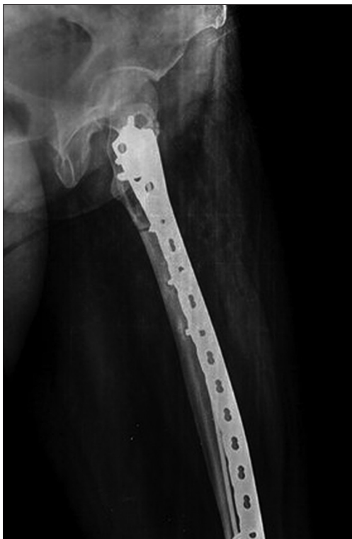
Figure 2: Lateral radiograph of the femur with hip joint showing the anterior curvature of the distal femoral locking compression plate, which matched the anterior bow of the femur

In our series, we had a case of ipsilateral neck femur with shaft femur. This 22 year male was operated four times and exhibited nonunion of neck as well as shaft femur with implant failure. We removed the broken PFN and inserted