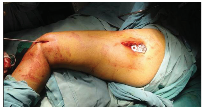
Figure 3: Clinical photograph showing primary fixation performed via a minimally invasive surgical approach. An elastic titanium nail with a diameter of 3 mm was used for reduction, and the plate was passed in minimally invasive manner