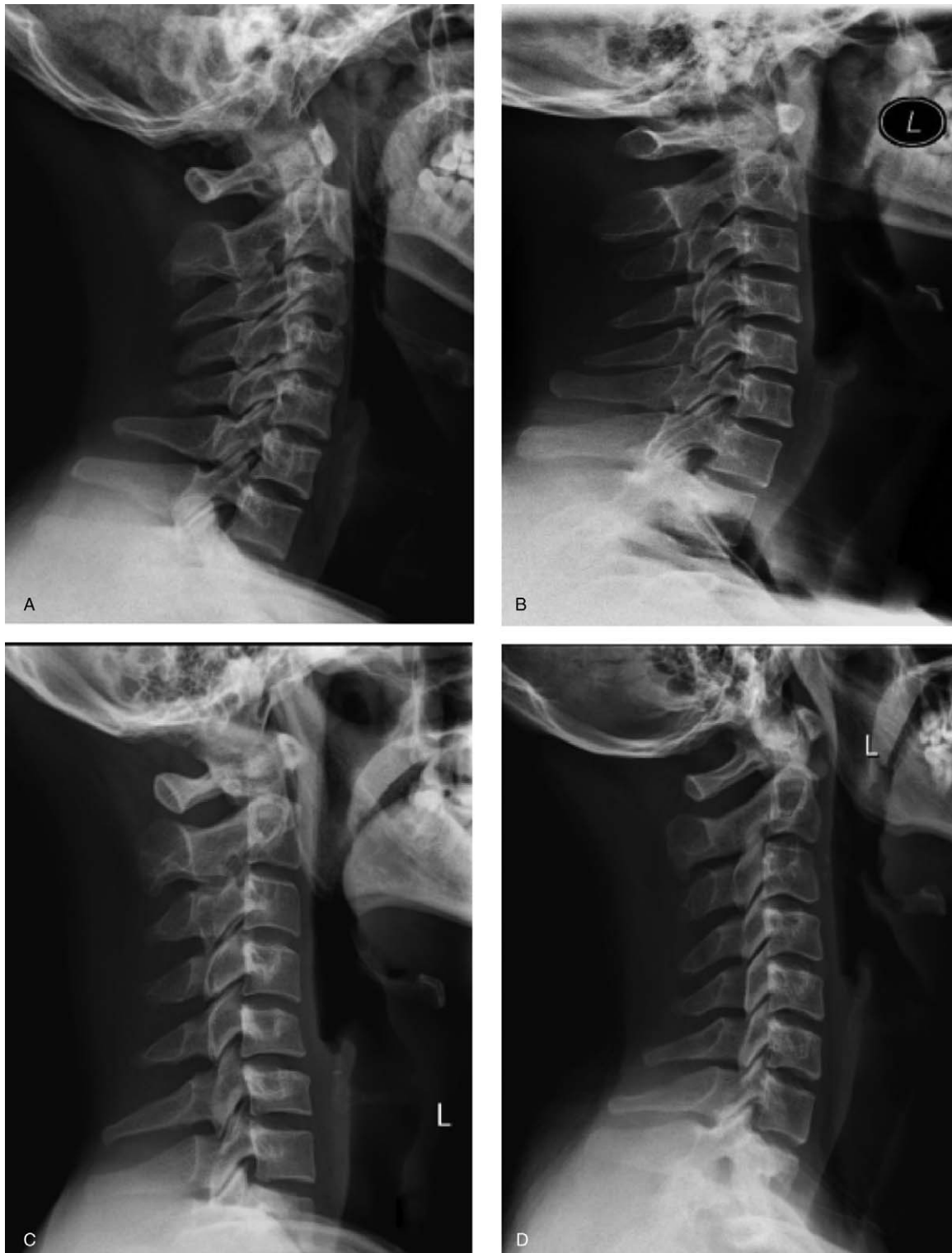
Figure 2. The type of cervical curvature according to the lateral cervical spine radiograph: (a) lordosis, (b) straight, (c) kyphosis, and (d) sigmoid.

lordosis angle reach adult like angles at age 14 to 15. [29] Children had more lordotic C1–C7 angle and more kyphotic FM–C1 angle. As for the correlation between the cervical lordosis and degree of disc herniation. The physiological relationship of sex, age, degree of disc herniation needs further exploration. We