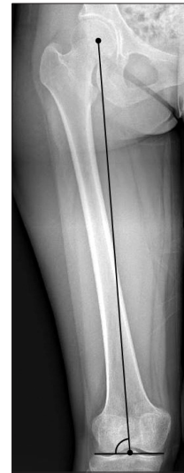
Fig. 5. Mechanical lateral distal femoral angle.