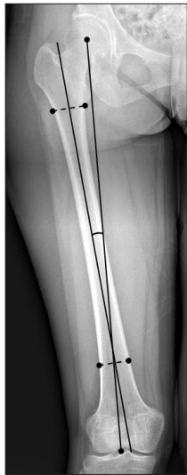
Fig. 3. Femoral anatomic mechanical angle.