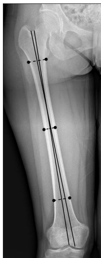
Fig. 4. Femoral bowing angle.

tween the femoral mechanical axis and the joint line of the distal femur (Figs. 1–5).