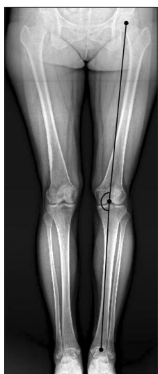
Fig. 1. Hip-knee-ankle angle.

Values are presented as mean±standard deviation.