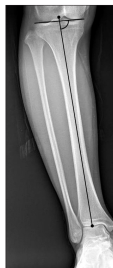
Fig. 2. Medial proximal tibia angle.