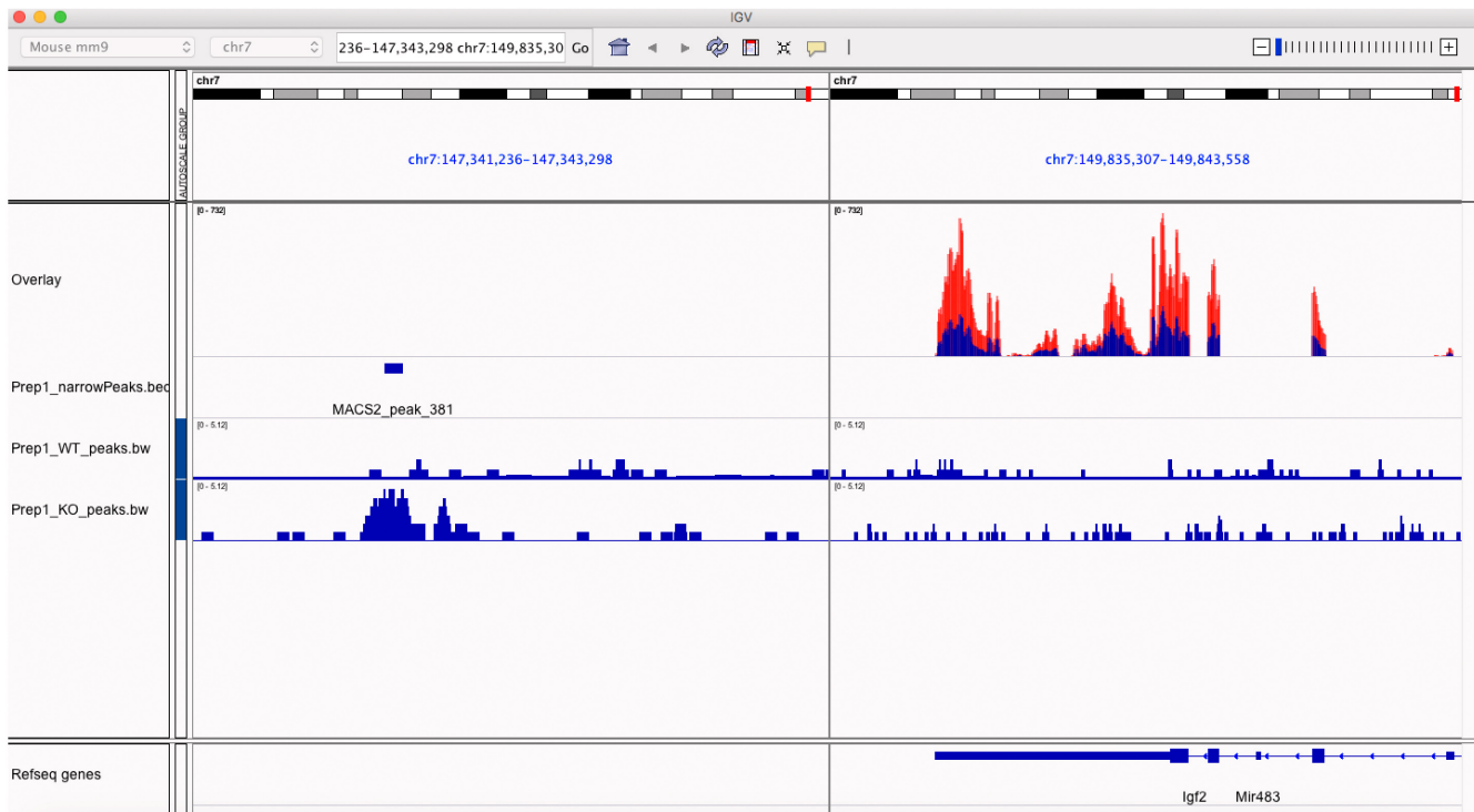
Figure 2. Epigenetic landscape of Prep1 binding and associated regulation of Igf2. The left panel illustrates the binding of the Prep1 transcription factor. In the right panel, we see the up-regulation of the gene, Igf2, as a result of this binding event.

same analysis. For instance, DESeq2 (Love et al. , 2014) can be employed in Gene Pattern as an alternative method for calling differential expression. Furthermore, there are many other alternatives for calling differentially expressed genes though they may not be available within the family of GenomeSpace tools, e.g., EdgeR (Robinson et al. , 2010), and so any issues of format compatibility would have to be handled by the user.