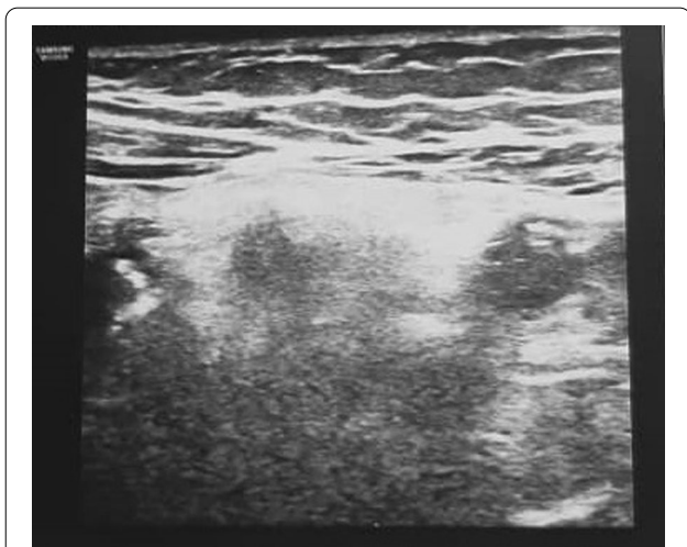
Fig. 1 Ultrasonography showing hyperechogenicity of pericecal fat with mild free fluid in the interloop at the site of tenderness in the right lower quadrant

The patient was nil per os (NPO) after hospitalization. We hydrated the patient with stat 300 cc lactate Ringer and 600 cc dextrose 5% in 0.9% sodium chloride once every 8 hours. Antibiotic therapy include ceftriaxone 750 mg twice a day, metronidazole 300 mg every 8 hours, and analgesic [Apotel as needed (PRN)] was prescribed intravenously. After surgery, the patient’s symptoms were ameliorated and he was discharged from the hospital 2 days later. Oral medication including metronidazole,