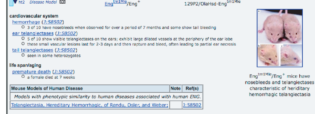
Figure 2. Using the new expansion features for comparing phenotypes. (A) The 'Phenotype summary' matrix is shown expanded for the cardiovascular system term [labeled 1]. Note the finer granularity of the terms. The genetic background effect in Eng^{im1Mle}/+ heterozygotes can clearly be seen. Heterozygote 4 (ht4) displays a normal cardiovascular phenotype, compared with the other two heterozygous genotypes (ht2, ht3). By glancing below to the 'Phenotypic data by genotype' section [labeled 2], it can be observed that in Eng^{im1Mle}/+ mice, the addition of background alleles from the CD-1 strain appears to confer a protective effect for these cardiovascular system phenotypes. (B) The 'Phenotypic data by genotype' section is shown expanded for one of the genotypes ( Eng^{im1Mle}/+ heterozygotes in the 129P2/OlaHsd- Eng^{im1Mle} strain, abbreviated ht2).