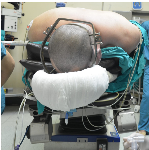
Fig. 3 The patient is placed prone on a plaster bed on the operating table, with several rectangular paddings filled between his ventral side and the plaster bed

The size of C6 and T1 facets to be excised should be carefully assessed before surgery and intraoperatively to avoid any compression of the nerve roots. Increased resection area provides ample space for osteotomy and instrumentation but may result in inadequate contact of the posterior column on closure of the osteotomy site, causing a gap, which may have an impact on the stability of the posterior column. In our morphometric measurements, the resected lengths of the C6 inferior facet and the T1 superior facet were 4.7 \pm 2.1 mm and 6.5 \pm 2.6 mm, respectively, for males. Intraoperatively, the C6 inferior facet or the T1 superior facet should be further removed, if the C7 and C8 nerve roots are not free. Reduction of the deformity was found to be the most critical step for a successful osteotomy, while intraoperative manual reduction was found to be the most basic and the most commonly reported technique [6, 23–25]. This technique required that the surgeon hold a Mayfield clamp or halo ring, while an assistant monitored the spinal dura and nerve roots. In our study, a plaster bed was placed on the Jackson table and the patient was placed in the prone position on the plaster bed with several rectangular paddings filled between his ventral side and the plaster bed (Fig. 3).