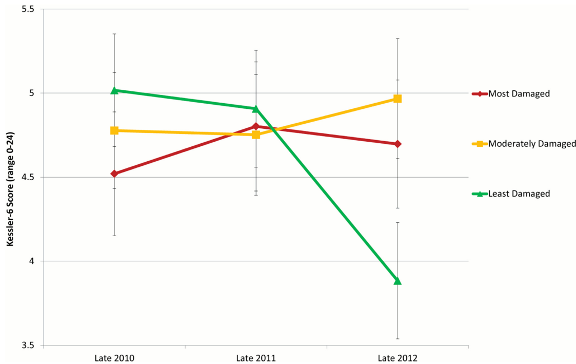
Fig 2. Kessler-6 scores across time for the three damaged-grouped regions in central Christchurch (means represent intercepts adjusting for gender and age, error bars represent the standard error of the intercept). Kessler-6 scores ranged from 0–24, with higher scores representing increased levels of psychological distress. The first of the large Earthquakes occurred in September 2011, the second in February 2012.