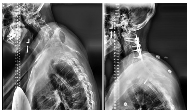
Figure 2: Neutral standing radiographs, preoperative (left) to 1Y postoperative (right) changes in a patient with baseline hyperkyphosis (BL: C2–C7 Cobb angle = -34.4^\circ ). Cervical lordosis was significantly restored at 1Y (C2–C7 Cobb = 4.3^\circ ) and cSVA significantly reduced (39.24–25.37 mm) without need for revision

HL of the cervical spine has been well documented with a wide range of symptomatology, however, no consensus for its range currently exists. [1,3,17-20] Our CD cohort had a mean C2–C7 Cobb angle of -7.13^\circ overall, indicating a more severe