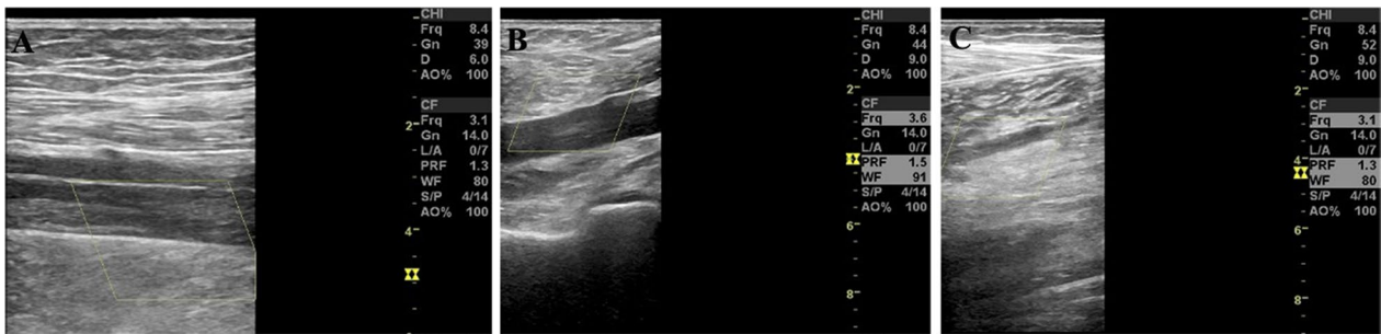
Fig. 2 Color Doppler flow images revealing DVT involving the lower extremities. A DVT in the superficial femoral vein of the right leg. B DVT in the popliteal vein of the right leg. C DVT in the intermuscular vein of the right leg. No signals of blood flow were shown above. DVT, deep venous thrombosis