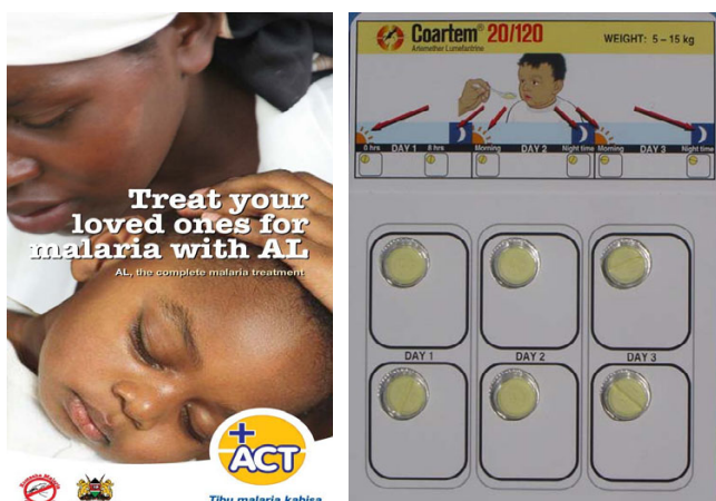
Figure 1 Figure showing public promotion of the generic terms "ACT" and "AL" (left panel) and labeled drug provided to patients (right panel).

implementation of any new ACT drug policy. First, the strident opposition from the local pharmaceutical industry through such professional bodies as the PSK was not entirely without merit. One of the key strategies of ensuring sustainable drug supply at national levels, and defined in the Kenya National Drug Policy [76], is local manufacture of pharmaceuticals. There was a feeling within local pharma that they were not adequately engaged in the policy change process and that real debate actually begun after the policy was announced in Naivasha by the Minister of Health. Legitimate questions such as what to do with their huge stocks of SP and AQ and currently the artemisinin monotherapies have not been adequately addressed.