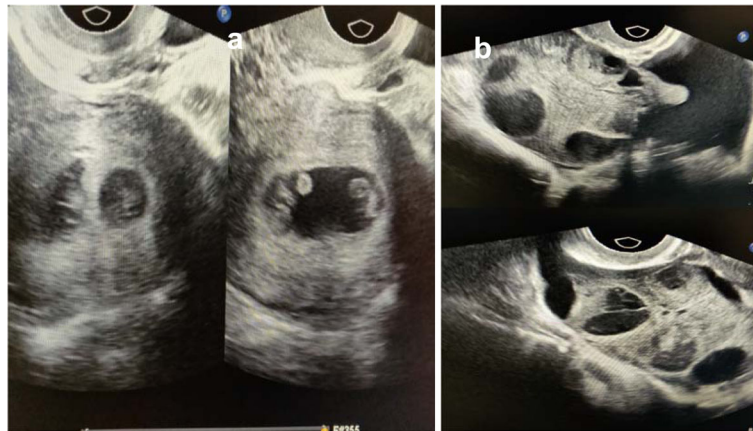
Fig. 2 Two chorionic sacs were visualized by transvaginal ultrasound without any inter-twin membrane between two of the triplets. b Transvaginal ultrasonography of bilateral enlarged multicystic ovaries (Upper: Left ovary Lower: Right ovary)