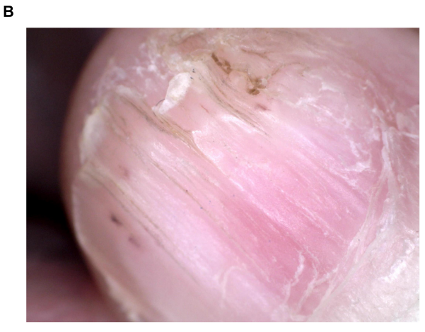
FIGURE 4 Clinical pictures of the patient's mother. (A) Several isolated keratinized papules were seen densely distributed on the face and neck of the patient's mother. (B) Longitudinal stripes and V-shaped defects were seen on the nails.

at least one of the classical lesions and 33% of patients had non-classical lesions of DD (7). According to their classification, we have found that our patient had only classical cutaneous manifestations as described before, but no non-classical lesions. In addition to the typical lesions, different patients may be accompanied by neurological and psychiatric disorders such as epilepsy, schizophrenia, intellectual disability, and so on. Our patient's mother was a patient with DD. Genetic screening of the family found that the patient had mutations in ATP2A2 gene, which was inherited from his mother. The family diagram