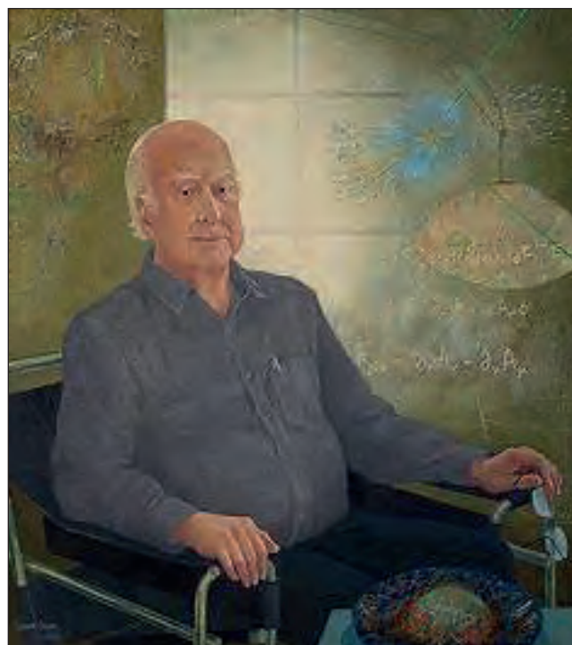
Figure 1. Sir Peter Higgs (1929-) by Victoria Crowe, OBE, DHC, FRESE, MA (RCA), RSA, RSW (1945-). Oil on canvas, 2014, 127 x 140.5 cm. Reproduced by permission of the Royal Society of Edinburgh.

The Higgs field causes elementary particles to attain mass 8 . CERN originally defined the Higgs boson as "a particle predicted by theory. It is linked with the mechanism by which physicists think particles acquire mass" 9 . Proof of the predicted particle, it was thought, would complete the Standard Model of Particle Physics developed during the second half of the last century 8,9,10,11,12 . Higgs' 1966