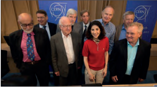
Figure 5. CERN, July 4, 2012; Announcement of the proof of the Higgs boson. Co-Nobel Prize winners in Physics 2013, Englert and Higgs are shown.