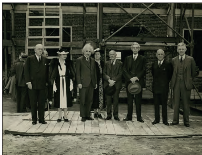
Figure 3. Cornerstone-laying ceremony, Fuld Hall, IAS, May 22, 1939

In October 1932 the Institute announced the appointment of its first two Professors of Mathematics, Oswald Veblen and