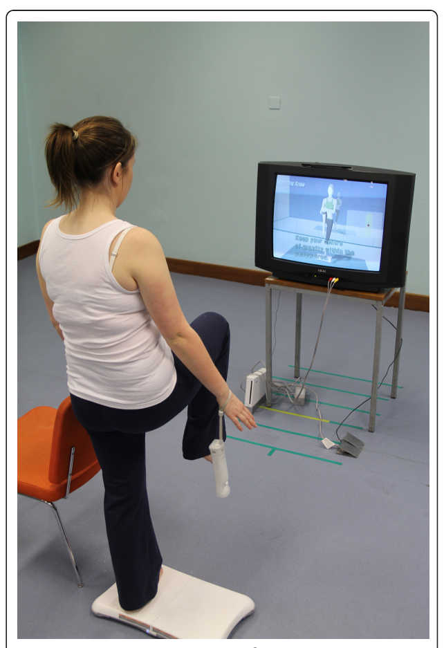
Figure 1 The Nintendo Wii Fit Plus <sup>®</sup>. The participant stands on the Wii balance board which monitors centre of pressure and reconstructs it visually on the television monitor as a red dot within a yellow area. A variety of exercises and games are available to retrain balance and encourage head movement. Stepping exercises can also be performed encouraging stopping and changing direction, in which the vestibular system has a role. Written consent to reproduce the image was provided by the subject in the photo.

The rehabilitation community is beginning to investigate the NWFP in the area of balance retraining [16,17]. Anecdotal reports indicate the NWFP is being used in