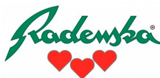
Figure 3. Radenska® brand name, used in the word-association task.

After the choice-based task with real-life elements, the Radenska brand was shown to all the participants in its original form. They were asked to write down the first thing that came to mind when they saw the image of the logo (Figure 3). Word association is a simple and quick qualitative method regularly used by psychologists and sociologists [45] and has been useful for extracting information from consumers about a brand [46]. The words stated in such a task are more spontaneous than closed questionnaires, which may produce more biased results [47], even though its greatest disadvantage is the complexity of data analysis, along with the subjectivity in how the responses are interpreted [46]. However, word-association tasks with symbols/pictures have recently been used in many different studies [38,43,48–50]. The word-association task was included in the last part of the questionnaire to avoid influence on the previous tasks, where the use of heart images was investigated.