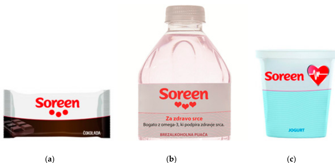
Figure 2. Examples of stimuli used in the conjoint analyses task: (a) Chocolate with a neutral brand (●●●); (b) soft drink with three hearts (♥♥♥); (c) yoghurt with health-implying heart image (♥).

The full factorial design comprised 27 ( 3 \times 3 \times 3 ) different profiles; to minimize them into a manageable format for the participants to evaluate, we used an orthogonal fractional factorial design that enabled all the attributes to be equally represented while maintaining statistical reliability. The final number of profiles used was nine; each was individually presented to the participants. They needed to decide how the consumption of the product shown would impact their health on a scale of 1 to 7 (1 = unfavourable impact and 7 = favourable impact). In line with CA methodology [33], the relative importance of individual attributes and the part-worth utilities of attribute levels were calculated.