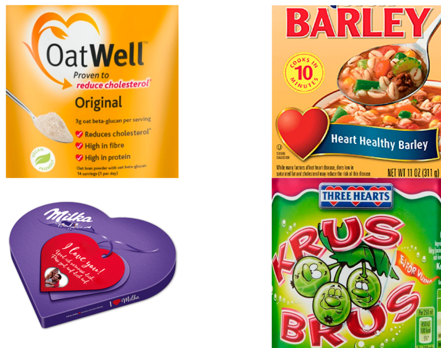
Figure 1. Examples of food labels with heart images in the international food supply (see Acknowledgements section for details).

the potential of specific images to (mis)lead. However, this memory-based method is appropriate for newly developed images, and not for existing, well-recognised brands.