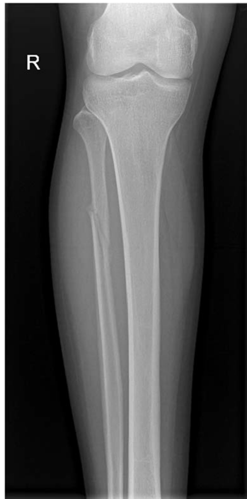
Fig. 3 Maisonneuve fracture after an external rotational injury to the ankle

Grade II (moderate) injuries include partial ligament tear with moderate pain, swelling and palpatory tenderness, mild to moderate instability, and moderate functional disability.