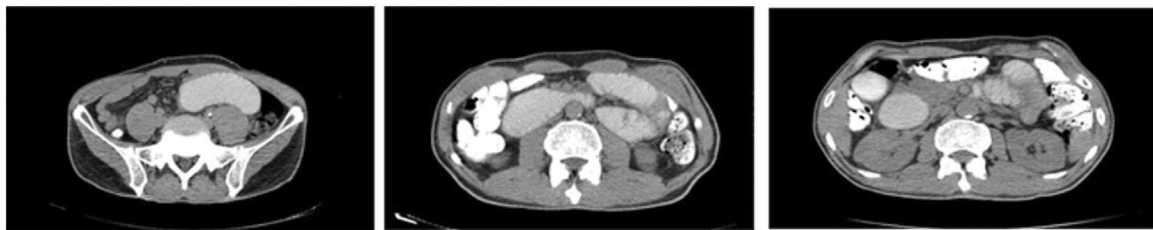
Fig. 2. CT abdominal scan after administration of Gastrografin revealed an increase of air-fluid levels.