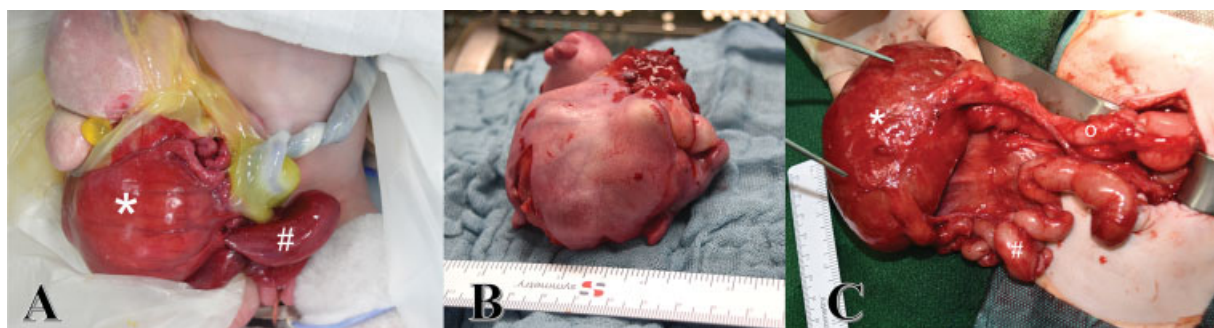
Fig. 1 (A) Ruptured omphalocele with umbilical cord teratoma (size of 7 cm) at birth and (B) after resection. (C) Proximal duodenum (o) leading into the distal cystic duodenum (*) with a caliber change of 6:1 followed by proximal stenotic jejunum (#).

After 36 + 6 weeks of gestation, a preterm newborn of 2,735 g (30th percentile) was delivered via C-section.