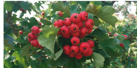
FIGURE 3: Wenxi experimental field (variety performance of Dajinxing treated with biological fertilizers).