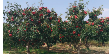
FIGURE 2: Wenxi experimental field (overall field and performance of Dajinxing treated with biological fertilizers).

5.5. Results and Analysis. As shown in Tables 1–3, for Crataegi fructus with 200 ml Anabaena azotica and Chlorella pyrenoidosa , the content of unsaturated fatty acid increased by 0.0041 g/100 g and the sugar content by 1.8% as compared with the control group.