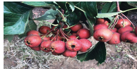
FIGURE 4: Wenxi experimental field (variety performance of Dajinxing without being treated with biological fertilizers).

As shown in Table 4, the content of organic matters was increased by 0.18% in soil treated with 400 ml Anabaena azotica and Chlorella pyrenoidosa .