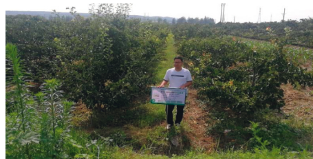
FIGURE 5: Jiangxian experimental field (immature Dajinxing treated with biological fertilizers).

The detection of organic matters in the soil was performed according to the soil organic matter detection method in NY/T 85–1988 with 50 ml burettes.