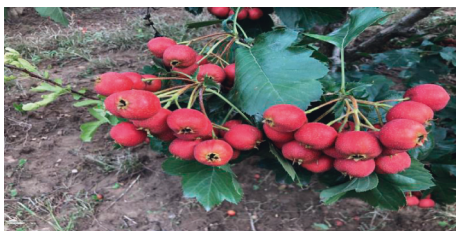
FIGURE 6: Appearance of “Dajinxing” treated with biological fertilizers.