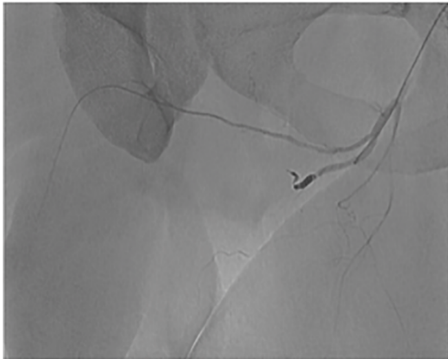
Fig. 2. The Embolized Artery. CT angiography image that shows the platinum coil located in the internal pudendal artery. One can appreciate there is no longer flow into the fistula or distal to the coil indicating successful occlusion.

Unfortunately, he was lost to further follow up.