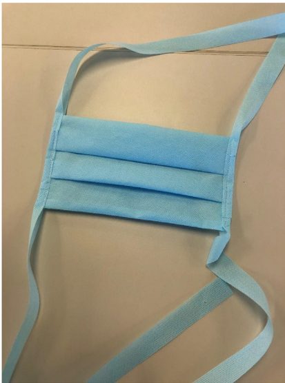
Fig 1. Face mask design specifications.

available to help guide those decisions. Davies et al (2013) assessed several household materials to determine which would be the safest alternative to commercial facemasks. 2 In measuring filtration efficiency, the researchers found a mean % filtration efficiency of 96.35 for a surgical mask, with the next best material efficiency rating being that of a vacuum cleaner bag at 94.35. T-shirts and scarfs demonstrated filtration efficiency of 69.42% and 62.30%, respectively. Though not ideal, Providence leaders attempted to identify materials with the highest filtration efficiency possible prior to beginning