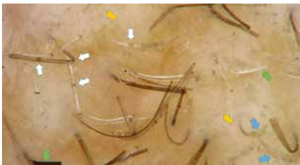
Figure 3. Trichoscopy of scalp dysesthesia. Brownish discoloration with darker wavy lines (yellow arrows) can be seen. Multiple short hairs can be observed: broom hairs (blue arrows), block hairs (green arrows) and trichorrhexis nodosa (white arrows) (70-fold magnification)