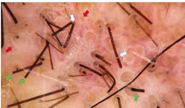
Figure 5. Trichoscopy of scalp dysesthesia, presents with the whitish area with prominent perifollicular yellow discoloration and cloud vessels (red arrows) arranged around follicular openings and around empty follicles. Short hairs: block hairs (green arrows) and trichorrhexis nodosa (white arrow) (70-fold magnification)