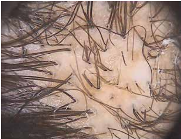
Figure 1. Trichoscopy of scalp dysesthesia. In the central part, a round area covered with short hairs can be observed. Notice brownish discoloration of the background (20-fold magnification)

vessels arranged around follicular openings and around empty follicles (33%; 3/9) (Figure 5); focal brownish discoloration with darker wavy lines (78%; 7/9) (Figure 3). Round yellow structures reflecting pustules were found in 2 of 9 patients (22%) (Figure 2). Some yellow dots (empty follicular openings filled with sebum) were also found (33%; 3/9).