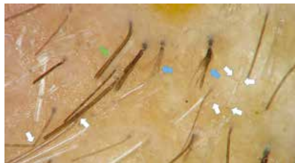
Figure 4. Trichoscopy of scalp dysesthesia. Trichorrhexis nodosa (white arrows); pay attention to the left side of the picture – two hair shafts in one follicular unit have nodosities at the same level (this confirmed the mechanical cause of these abnormalities). Broom hairs (blue arrows), and brownish background discoloration can be noticed (70-fold magnifications)