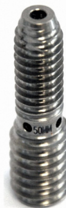
Figure 1 The AxiaLIF rod. Note: 50 mm length shown. Abbreviation: AxiaLIF, axial lumbar interbody fusion.

Procedural steps have been discussed in detail elsewhere. 19 Patients followed a bowel preparation protocol the night before surgery. At surgery, the patient was placed prone and, under fluoroscopic guidance, a 2 cm incision was made on either side of the paracoccygeal notch to gain entry to the presacral corridor. Blunt finger dissection was used to displace the rectum away from the sacrum and a blunt guide pin was then advanced through the presacral space and docked on the inferior endplate of the sacrum. A series of dilators were advanced over the guide pin and a working cannula was anchored with K wires to the sacrum. A cannulated drill created a bony channel in the sacrum and provided access to the L5–S1 disc. Nitinol cutters were used to morselize the disc material, completely preserving the annulus, and to denude