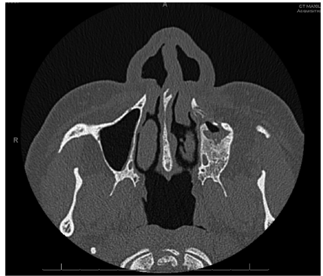
Fig. 2. CT of the sinuses without contrast: Chronic left maxillary sinusitis with associated erosion of the anterior/inferior wall of the left maxillary sinus as well as the left maxillary alveolar ridge and hard palate. There is focal defect at the floor of the left maxillary sinus. There is mild soft tissue prominence anterior to the left alveolar ridge, overlying the area of osseous erosion, without evidence for drainable fluid collection.

[2,5–9]. The exact pathogenesis of antroliths are not clear, although it is suspected that generally a foreign body causes surrounding inflammation, encouraging mineral deposition and serving acts as a nidus for mineral deposition [3,4], over a span of years [10,11]. Antroliths can be the cause of chronic sinusitis as obstruction can provide an environment for infection to occur. Alternatively, chronic sinusitis itself can encourage the development of an antrolith as chronic inflammation and long standing infection can foster deposition of calcium and other mineral salts in the affected area [2]. In our patient, it is unclear whether an antrolith preceded or was caused by his chronic sinusitis. It is possible that his prior trauma to the left maxillary region provided an inflammatory environment for the formation of the antrolith around a nasal polyp causing chronic sinusitis. It is also possible that post-trauma, the sinus structure was altered such that flow between sinuses became limited, predisposing the patient to infections in the area and thus encouraging antrolith formation.