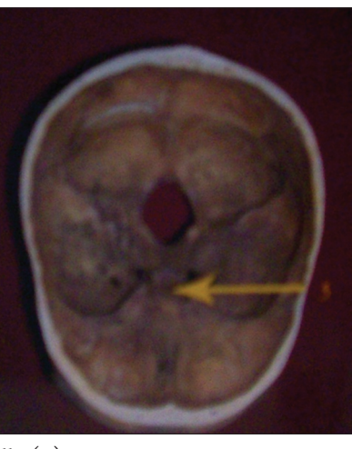
Figure 3: Sella (5)