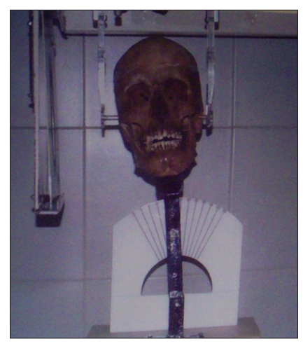
Figure 7: -5°