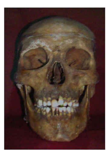
Figure 1: The skull

The skull is seated over the artificially prepared stand in such a way that Frankfort horizontal plane of the skull will be placed parallel to the floor and is stabilized completely in anteroposterior and transverse axis by adjusting the screws. The