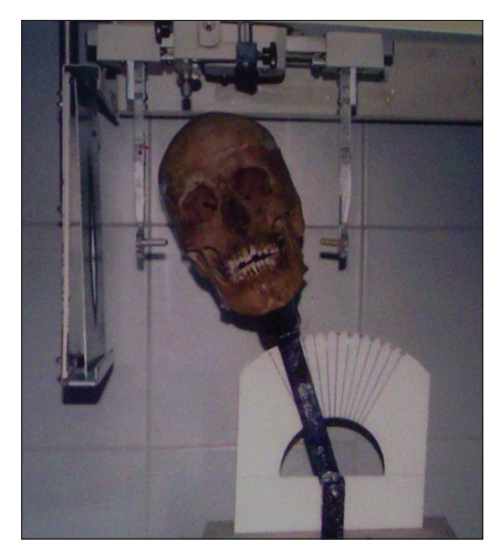
Figure 8: –20°