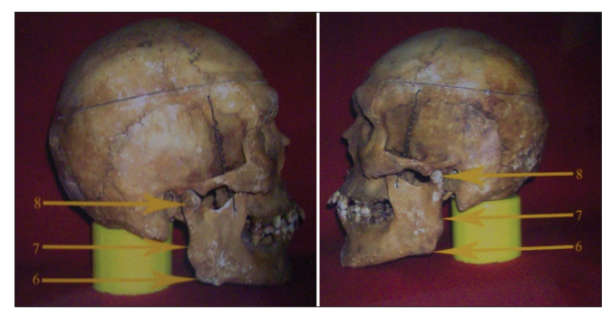
Figure 5: Right and left sides of the skull, gonion (6), ramus down (7), articulare (8)