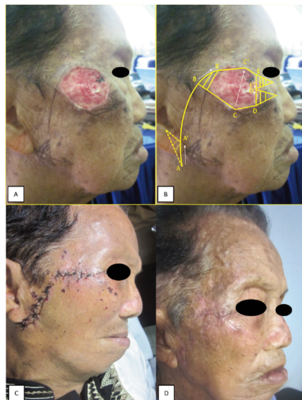
Figure 2. (A) Initial lesion; (B) M-plasty advancement flap followed by rotational flap to achieve complete defect reconstruction; (C) Immediate post-operative result (D) Result after four weeks showing excellent functional and cosmetic result after six months.