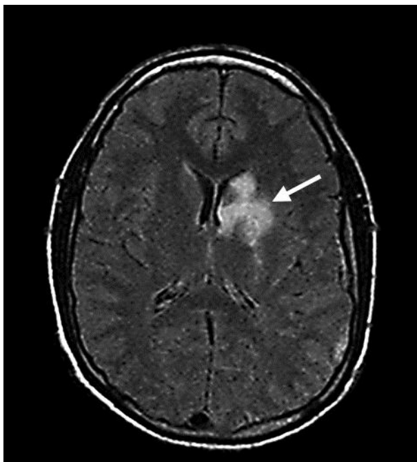
Fig. 1. Diagnostic imaging (MRI): transverse plane through the brain to the lateral ventricles. The T2-weighted FLAIR image shows an infarction of the left anterior basal ganglia and internal capsule (arrow).