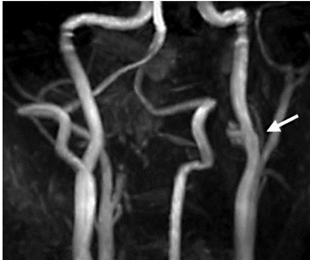
Fig. 2. The TOF (time of flight) MR angiography reveals a pseudoaneurysm (arrow) of the left distal carotid artery.