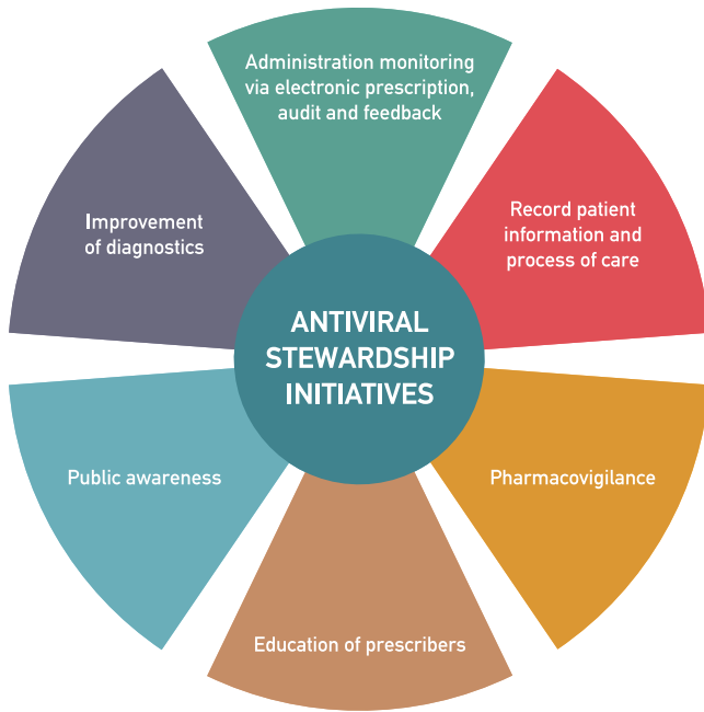
Fig. 1. Antiviral stewardship initiatives for the judicious use of the new oral treatments against COVID-19.

appropriate management, including administration of antiviral treatment in those in need. This factor is pivotal in the case of the antivirals discussed here, which are more effective during the early stages of COVID-19. Countries that are investing in these medications are expected to enhance their diagnostic yield by supporting their testing capacity (either molecular or antigen testing or both) to meet the expected needs of prompt diagnosis.