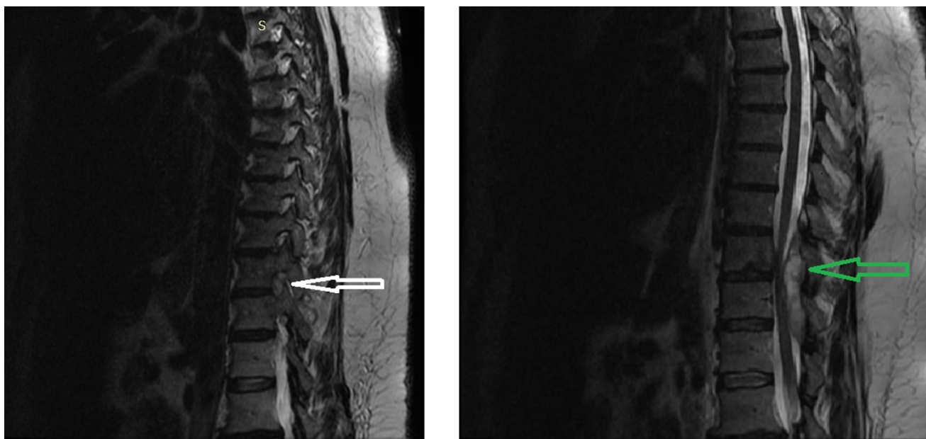
Fig. 1 – T2-weighted sagittal section of Magnetic Resonance Imaging (MRI) of the thoracic spine showing ligamentum flavum hypertrophy causing significant canal compression from posterior aspect (green arrow) with liquid in the costovertebral joint (white arrow).