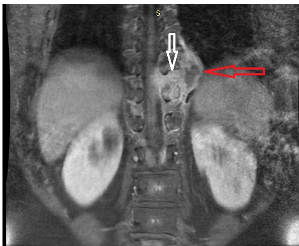
Fig. 3 – T1-weighted coronal section of the MRI of the thoracic spine, showing liquid in the costotransverse joint (white arrow) and paravertebral abscess (red arrow).

secondarily for confirmation of the diagnoses and to establish the exact lesions. Histopathological confirmation can confirm the diagnosis [2]. Treatment with antitubercular drugs should be started as soon as the diagnosis is made [6]. Surgery for posterior elements' tuberculosis is indicated for neurological deficits and establishing the final diagnosis [2].