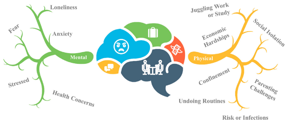
Fig. 3. Factors associated with 'COVID-Somnia'.

In addition to validating the effect of COVID-19 on insomnia, a significant number of studies have used different sampling methods, measurements, and criteria for insomnia. Thus, there is much uncertainty in making comparisons between studies (Morin et al., 2021). Most of the