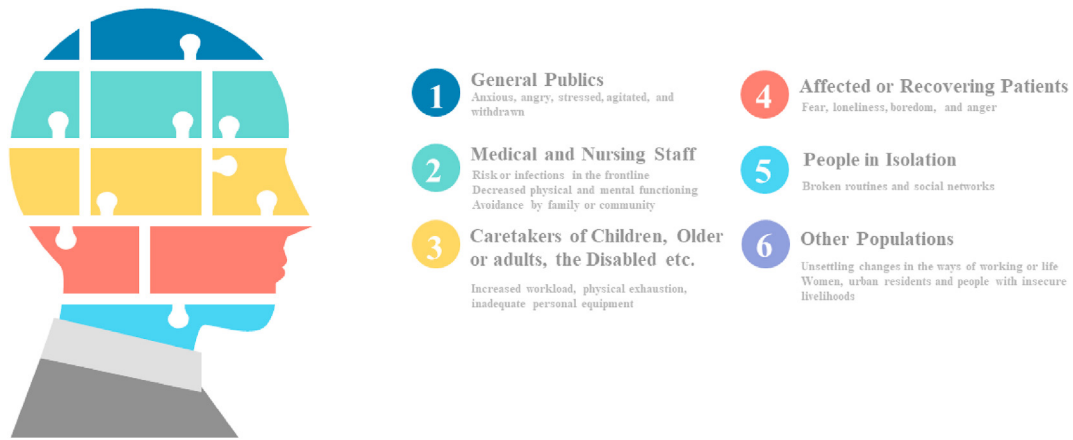
Fig. 2. Potential people with insomnia due to COVID-19.

cannot be neglected. In existing scholarly research, COVID-related insomnia is recognized as a mental health issue associated with significant psychological burden among different groups, except for the general public. For example, these groups include patients with COVID-19 or other diseases, medical or healthcare professionals combating the COVID-19, caretakers of special groups, and those in lockdown (Fig. 2).