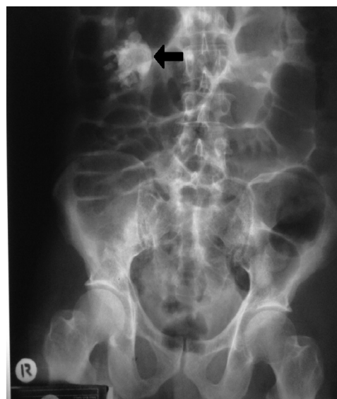
Figure 1. An abdominal X-rays (AXR) revealed a stone in the right upper quadrant (←).

chronic parenchymal disease of the right kidney with calculi of size 2 cm x 2.5 cm. Abdominal X-ray (AXR) supported the suspicion of an opaque renal stone (Fig. 1). A fistulography was performed using 60% urografin, which revealed a communicating fistula with the