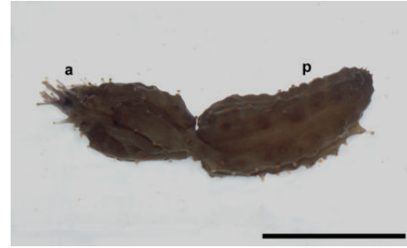
FIGURE 1: Twisting of Cladolabes schmeltzii during fission. a: anterior part; p: posterior part. Scale bar 2 cm.

Currently, no studies of the contribution of the nervous system to fission regulation and studies of the cellular and molecular mechanisms of fission in holothurians have been done. There are only data on the properties of the extracellular matrix. The connective tissue in holothurians possesses a unique ability to alter its mechanical properties under