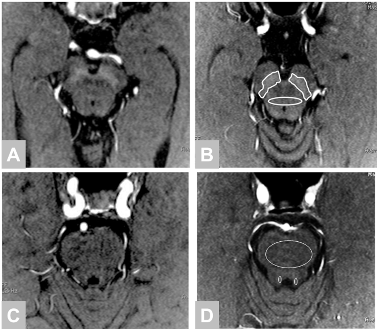
Figure 1. Neuromelanin imaging in the midbrain. A, C: 30-year-old male with schizophrenia, CR_{SN} = 12.9 , CR_{LC} = 10.7 ; B, D: 26-year-old female healthy control, CR_{SN} = 6.2 , CR_{LC} = 7.6 Demonstrating a region of interest drawn around the substantia nigra and midbrain tegmentum side on Figure 1B and locus ceruleus on Figure 1D. doi:10.1371/journal.pone.0104619.g001