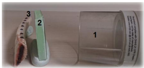
Fig. 2. The X ray tube (2) The simulated soft tissue (3) Bone segment with implant fixtures placed.