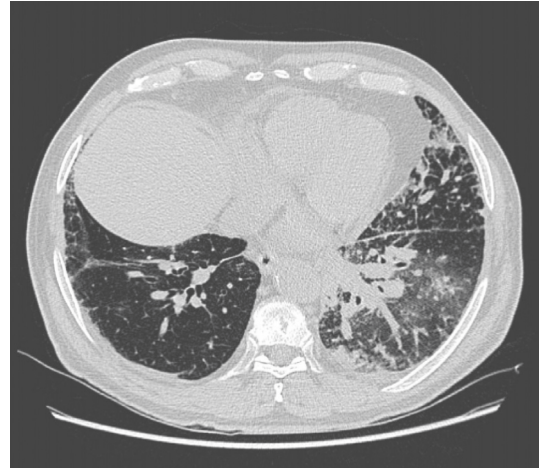
FIGURE 1: Computed tomography of chest showing transverse view of lungs with multiple patchy ground glass opacities with predominant lower lobe involvement, more than a month after initial presentation.

Then, he developed bilateral metacarpophalangeal swelling and pain and swelling. To treat LIP, he was started on oral prednisone at a dose of 20 mg/day (0.25 mg/kg). His joint symptoms improved markedly. A laboratory workup was positive for the SSA antibody, and he was diagnosed with Sjögren's syndrome. His CRP was elevated (191 mg/l) and complement levels were low (C3 and C4, 40 mg/dl and 1 mg/dl, respectively). He tested negative for anti-SSB, anti-Jo-1, anti Scl-70, anti-neutrophil cytoplasmic, and