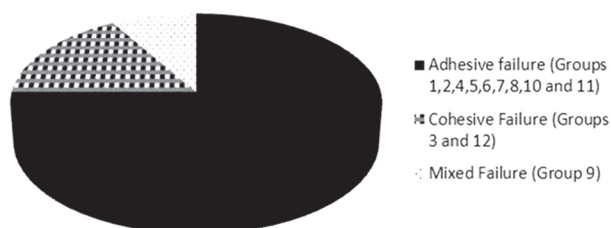
Figure 2: Type of bonding failure for all groups

Means followed by same letters did not differ among each other ( \alpha=.05 /Tukey's HSD test)