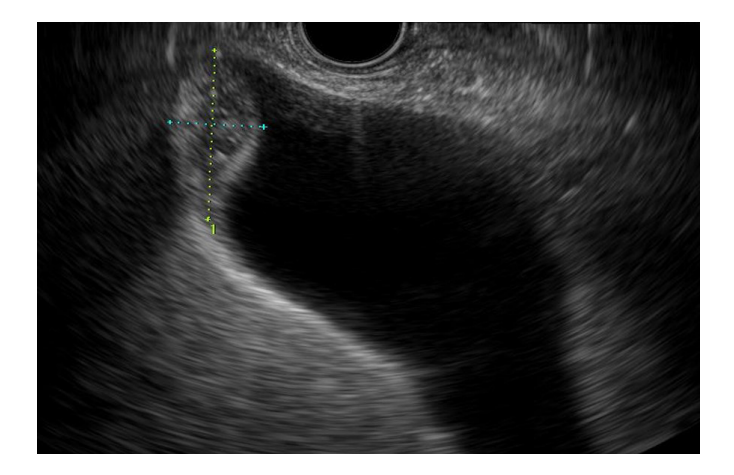
Fig. 2. Endoscopic ultrasound image shows about 2 \times 1 cm sized elliptical wall thickening without disruption of the wall layer. Internal echogenicity was mixed with diffuse hyperechoic spots and hypoechoic lesions.

of a rapidly growing mass-like lesion, which made it difficult to rule out malignancy. Abdominal CT and EUS cannot differentiate between adenomyomatosis and adenoma. In addition, the role of magnetic resonance imaging (MRI) is limited in making a definite diagnosis compared with CT and EUS. Therefore, we decided to perform surgery instead of further follow-up or evaluation, such as an MRI. Histopathological examination of the resected gallbladder showed a Rokitansky-Aschoff sinus