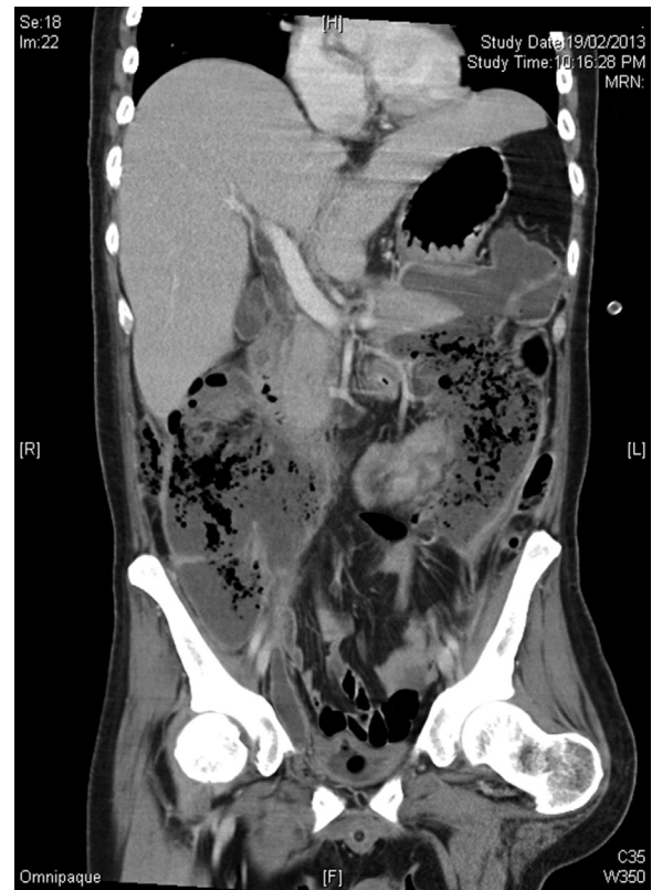
Fig. 1. CT scan showing gas formation and bilateral retroperitoneal peripancreatic necrosis.

repeated on the right side. The incisions were covered with a ureterostomy bag and continuous saline irrigation through the percutaneous drains was started at 200 ml per hour.