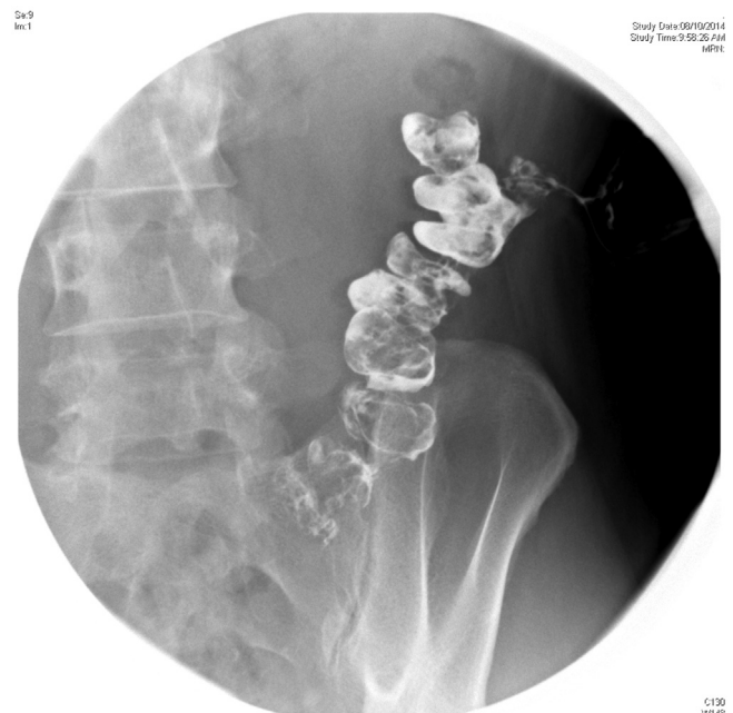
Fig. 5. Fistulogram of Descending colon fistula.

This case study illustrates the Step-up approach to pancreatic necrosis and the complexities of managing infected pancreatic necrosis. The Step-up approach can be regarded simplistically to consist of the 3 D's: Delay, Drain and Debride [3]. Delay of surgical debridement allows demarcation and 'walling-off' of necrotic tissue. Drainage of infected focus aims to treat the infected necrosis as an abscess, allowing a third of patients to avoid surgical debridement, which carries high risks. This can be performed percutaneously or endoscopically via a transgastric route. The choice depends on the location of the infected space and expertise available. In this patient, transgastric route was not possible as the necrosis affected