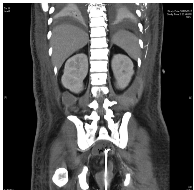
Fig. 2. Transrectal drain to presacral collection.

His sepsis improved (Fig. 4) but 2 days later he developed bleeding from both flanks and per rectal bleeding. CT angiogram