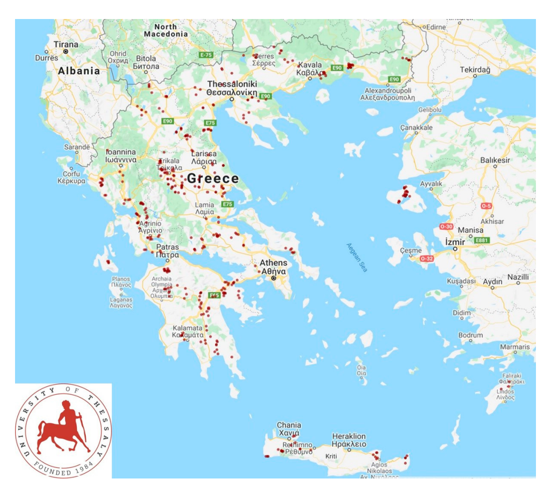
Figure 1. Location of 444 sheep flocks/goat herds around Greece, in which interviews were performed.

Details regarding as many as possible of 48 questions (Appendix A) were also recorded during the on-site visit by another investigator (CKM), who was present in the farms. The breeds of the sheep/goats in the farm (questions: 137–140) were confirmed by a European Veterinary Specialist in Small Ruminant Health Management (GCF). After conclusion of the interview, details regarding as many as possible of 56 questions (Appendix C) were also collected by an investigator (DTL) from the veterinarian, who had arranged the visit.