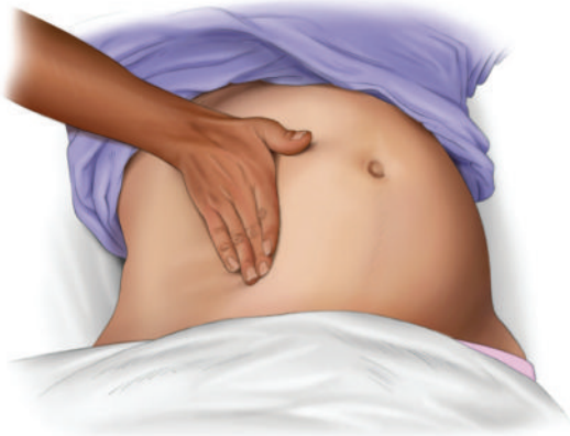
FIGURE 3: Left uterine displacement using 1-handed technique [3].

During pregnancy, the elevated diaphragm may result in the need for lower ventilation volumes. There is concern about the risk of aspiration during maternal cardiac arrest due to the reduced lower esophageal sphincter competency [31–33]. Yet, the routine use of cricoid pressure is no longer recommended in the American Heart Association (AHA) resuscitation guidelines as it may impede laryngoscopy and ventilation and may not prevent aspiration [34, 35].