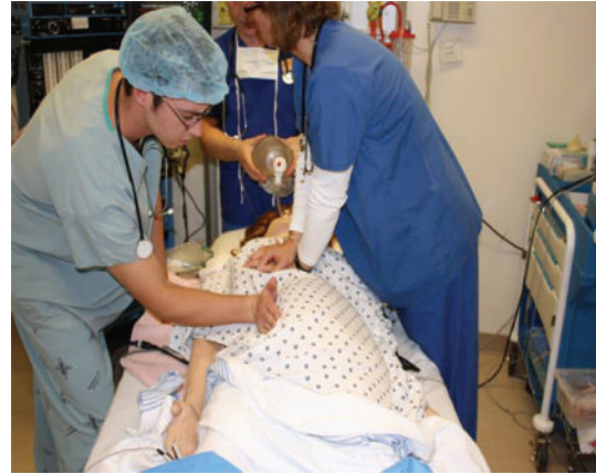
FIGURE 4: Manual leftward uterine displacement-with resuscitation team [10].

3.3. Circulation. The major circulation concern during a maternal cardiac arrest is the possibility of aortocaval compression caused by the gravid uterus. The gravid uterus can compress the inferior vena cava resulting in a reduced preload and stroke volume [36–38]. We know that by at least 20 weeks