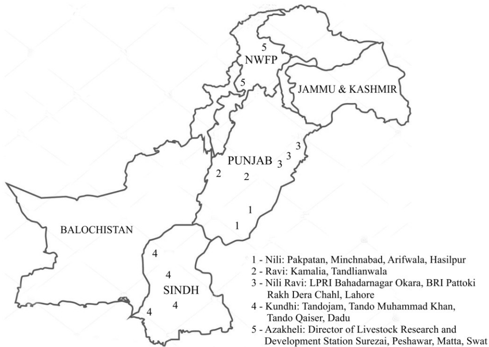
Fig. 1. Map of Pakistan showing sampling locations of the studied buffalo breeds. Numbers in the legend correspond to the numbers typed on the map and present information about breeding tracts of the studied breeds