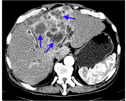
FIGURE 1: Computerized tomography of the abdomen with